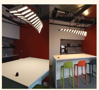
Installation at EYP headquarters in Albany, N.Y.

To showcase the potential of OLED lighting and to better understand the unique challenges of this technology, the LRC and its partners custom-designed an OLED luminaire for demonstration and evaluation. EYP Architecture & Engineering, which brought the architectural designer and enduser perspective, created the luminaire conceptual design and hosted the site demonstration. OLEDWorks, which brought the light source manufacturer perspective, developed the OLED panels for the luminaire. LED Specialists, which brought the electronics and controls perspective, designed custom drivers for the OLED panels. The LRC, which brought the luminaire integrator perspective, conducted the mechanical and electrical engineering of the luminaire, including 3-D printing of the OLED panel holders and connectors.