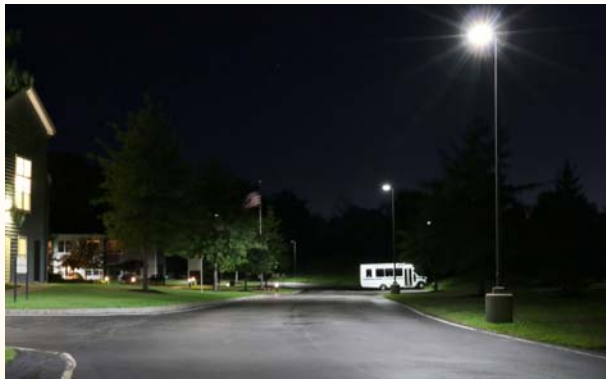
LED technologies are being used more frequently for street lighting.

Energy economic analyses confirmed that the initial investment could be paid back in terms of reduced operating costs, and that energy savings were larger for LED systems when compared to HPS systems that produced similar levels to those from the LED alternatives. Further energy cost savings would be expected with the use of adaptive lighting controls specified to take advantage of temporal nighttime traffic patterns on the roadways investigated.