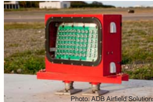
Runway end identifier lights can produce flashes of light each with multiple pulses.

Flashing lights are often used in aviation signaling because they have better attention-capturing properties than steady-burning lights. Different formulae exist for calculating the effective intensity of flashing signal lights that can use multiple pulses of light within each flash, such as runway end identifier lights.