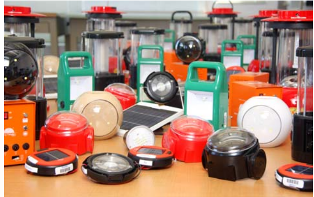
Samples of off-grid LED lighting products being tested at the LRC for the Lighting Africa program.

Lighting Research Center, Rensselaer Polytechnic Institute • 21 Union Street • Troy, NY 12180 • (518) 687-7100 • www.lrc.rpi.edu