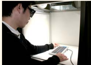
LRC researchers tested PV panels under the standard testing condition of one sun level, 1000 w/m 2 , and verified that the results met the manufacturers' claims.

The LRC is performing these evaluations on 30 types of products, 12 samples of each for a total of 360 test samples.