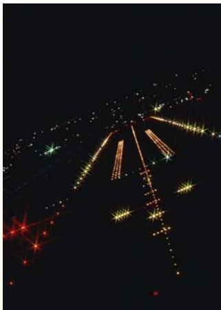
Adequate color discrimination is important for pilots to identify runway and taxiway signal lights.

With the expected growth of LEDs in airfield (runway and taxiway) signaling applications, it is important to ensure that pilots, including those with color-vision deficiencies, can adequately identify these signals. Commercially available LED sources