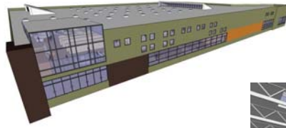
The daylighting scheme for this large-scale food supplier uses roof monitors, skylights, and an integrated skylight system that incorporates the company's graphics into the diffuser design.

D aylighting services at the LRC support the design analysis and integration of advanced daylighting technologies to save energy and improve daylighting in buildings.