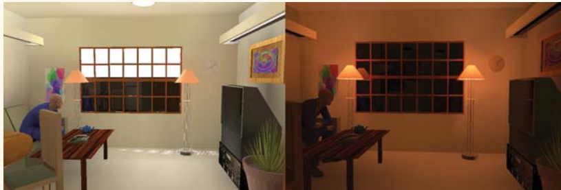
Proposed lighting scheme with high CS by day and low CS at night.

High CS by light can be achieved by providing at least 400 lux at the cornea of a circadian-effective white light source (i.e., more short-wavelength energy) during the daytime. Light levels recommended here are high enough and long enough to assure an effect on the circadian system of older adults, based on a model of human circadian phototransduction by