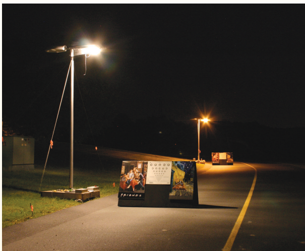
Subjects evaluated perceived brightness and sense of security under varying lighting conditions using ceramic metal halide lamps (foreground) and high-pressure sodium lamps (background).

The LRC has conducted over 25 studies in the past decade looking at the impact of light level and spectrum on visual detection and response time at night. A unified system of photometry was developed from those studies and was used successfully to make predictions of visual performance while driving at night (Akashi et al., 2007).