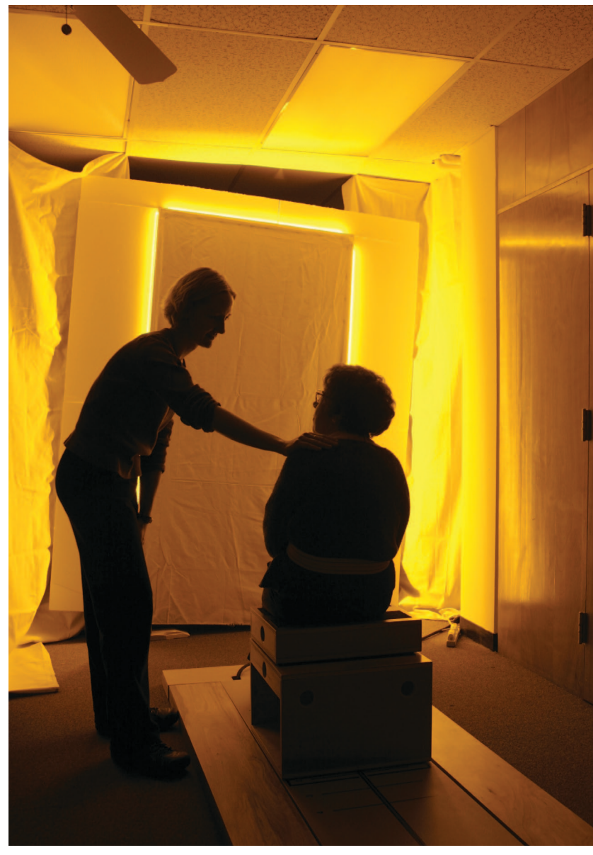
Horizontal/vertical nightlights, as proposed in Dr Mariana Figueiro's 24-hour lighting scheme, reduce the risk of falls for older adults by helping them maintain balance and navigate at night.

ver wondered why bright light lifts your mood or why you eat more when you're tired? Ever noticed that you sleep better when you've spent the morning outside? Whether or not you're conscious of these bodily responses, they're all being triggered by the same thing: light.