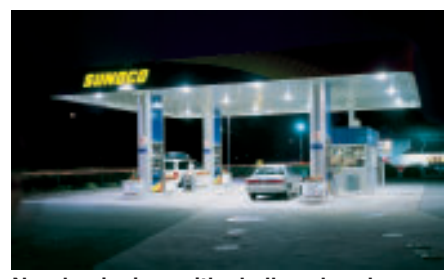
New luminaires with shallow drop lenses