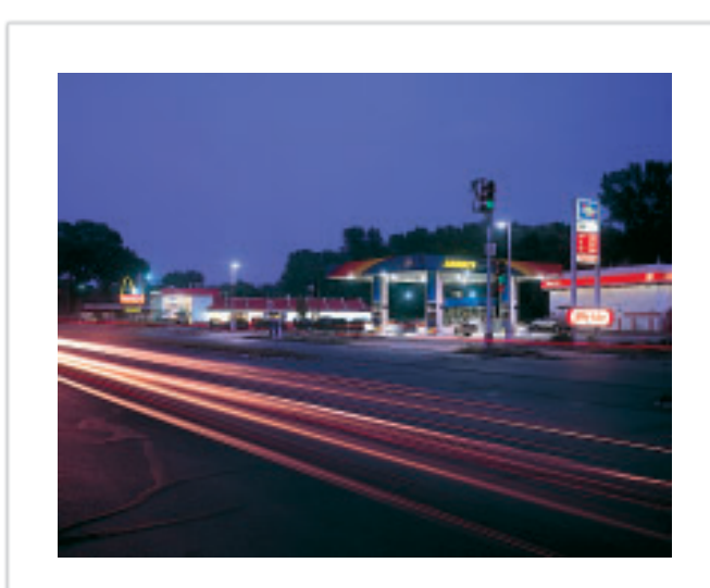
Sunoco Gas Station Springfield, MA

The Sunoco station at 1390 Allen Street, Springfield, MA, is located in a typical suburban area. It lies in a cluster of fast-food restaurants and shops along a divided highway, facing and backed by residential areas. In 2001, DELTA replaced the original deep drop-lens luminaires with ones that had a shallower drop lens.