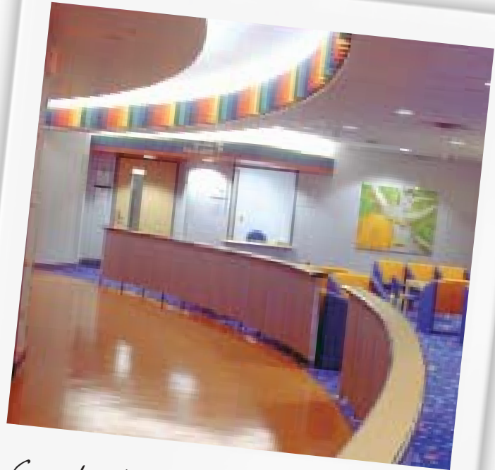
Connecticut Children's Medical Center Corridor

One intent of the design of the Connecticut Children's Medical Center was to provide visual variety for children and parents visiting the hospital. An asymmetrical architectural cove echoes the shape of the curved corridor, and the soffit drop on one side suggests an edge to the corridor without a full wall. Fluorescent striplights directly light the ceiling and the multicolored, folded steel sculpture mounted to the base of the soffit, and indirectly light the path below. Good color rendering lamps are used to flatter skin tones and the colors of the sculpture.