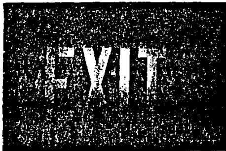
Figure 1. An electric, transilluminated exit sign photographed in smoke.