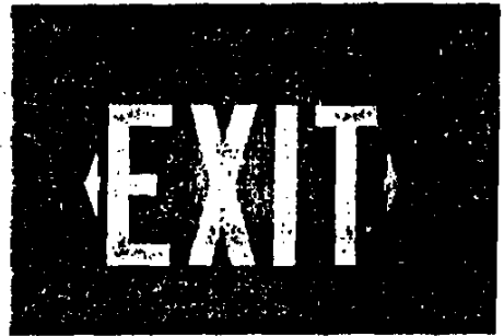
Figure 2. The same sign as shown in Fig. 1 made brighter by adding more internal lights.