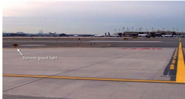
Runway guard lights on the airport tarmac.

Federal Aviation Administration (FAA) [Contract FAA/05-C-AT-RPI Amendment 8]