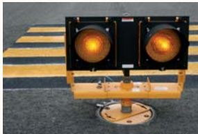
Runway guard light.

As part of the FAA's Centers of Excellence program, the LRC is exploring the potential performance and application of new light source technologies, primarily LEDs, in airport and airfield lighting. Recently, LRC scientists compared the functioning of runway guard lights (RGLs) using LEDs to those using traditional incandescent light sources. RGLs indicate where pilots should yield when maneuvering a plane onto an active airport runway.