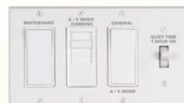
Teacher control center

The ICLS typically includes two rows of pendant direct/indirect luminaires and a separate wallwash luminaire for the main teaching board. The teacher control center (TCC) allows the teacher to change the lighting distribution from General mode (both uplight and downlight) to A/V mode (downlight only). The A/V mode, intended to be used during audio-visual presentations, includes an adjustable dimmer. The Whiteboard switch allows the teacher to direct light towards the main teaching board. The Quiet Time switch overrides the occupancy sensor for one hour, keeping the lighting on during long periods of occupied non-movement such as standardized testing. The TCC is located near the main teaching board. Other controls in the ICLS include a hybrid ultrasonic/infrared occupancy sensor and a master on/off switch at the door.