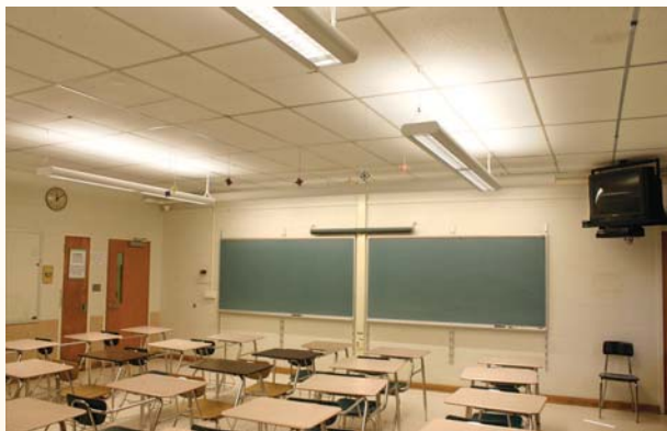
Above: General mode (uplight and downlight) and Whiteboard light. Below: A/V mode (downlight only).

The Integrated Classroom Lighting System (ICLS) provides these two lighting modes with controls technology to facilitate switching between modes. Seven schools in New York State participated in a demonstration of the ICLS. At each of the seven schools, the DELTA research team evaluated the lighting before and after retrofit of the ICLS in four classrooms.