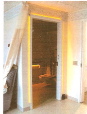
Figures 1a and 1b: Motion-sensor controlled amber LEDs installed under bed (left) and around doorway (right). The LED array under the bed provided general, low-level ambient light in the bedroom at night; illuminance levels between 10 and 15 lux were measured on the floor next to the bed. The LED array framing the bathroom door contributed approximately two to 10 lux on the floor near the door and when standing at the door frame, 10.5 lux was measured at the plane of the cornea. Notes: 1) photosensors were disconnected for the photos; 2) overhead fluorescent luminaire was kept off after installation of night-lighting.