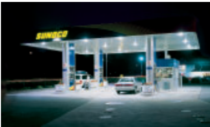
New luminaires with shallow drop lenses