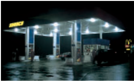
Original luminaires with deep drop lenses